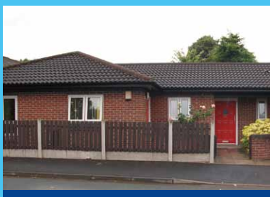
Norwood Drive, Trafford

A new service was implemented for 3 service users with learning disabilities and complex needs in Donabate, North East Dublin.