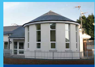
St Paul's Court