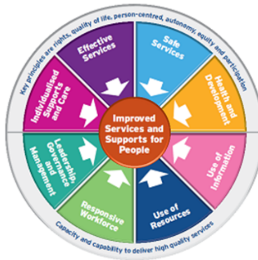
Figure 1: Themes in the National Standards